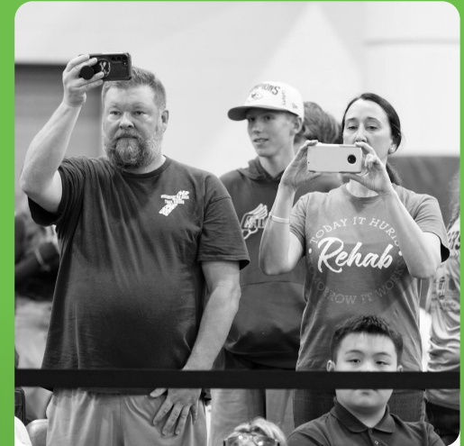
Families or Groups