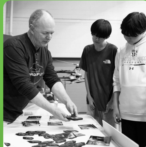
Corporate Volunteer Teams