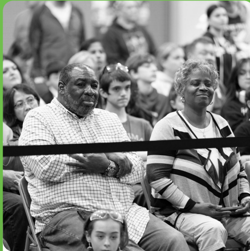
Retirees or Empty Nesters